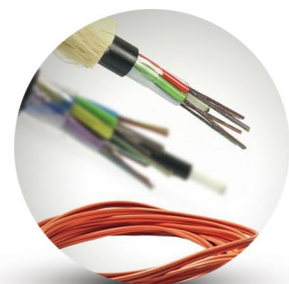
Cable & Monofilament