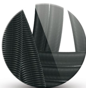
Electrical & Electronics